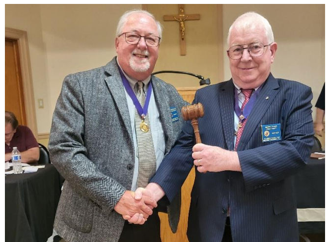
Passing the gavel to the new Grand Knight!